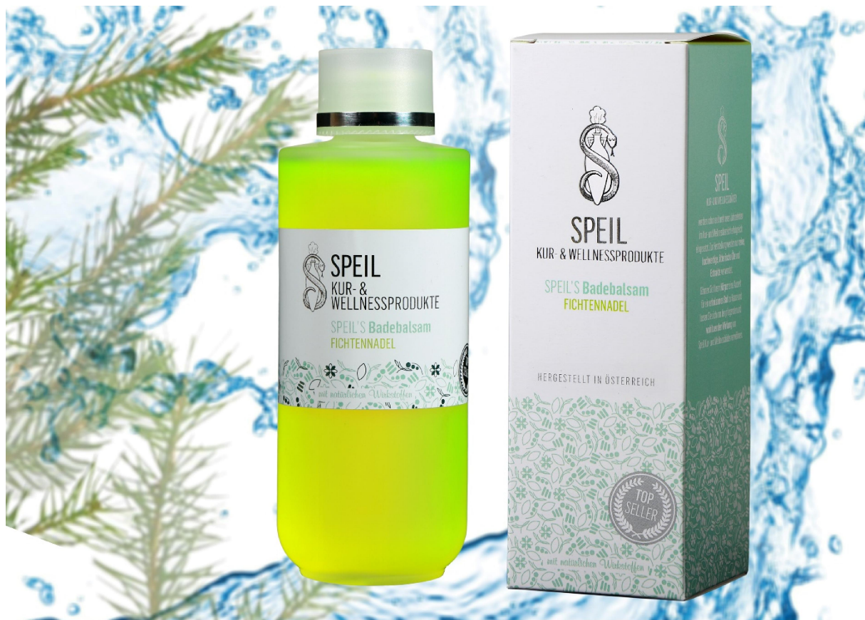
Speil's Balsam Bath Spruce needle exclusive line